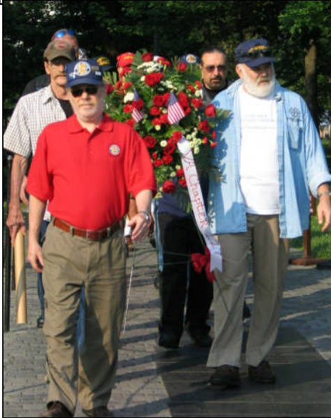
Where are you? AWOL? No excuse, Sir!

So, FALL IN!, for our Memorial Day weekend events!