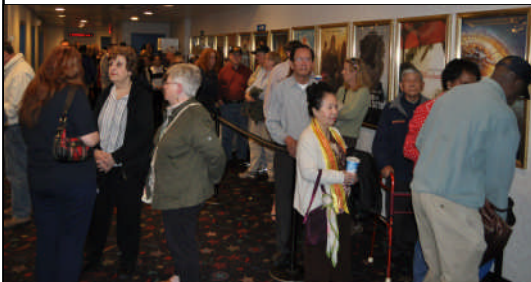
Movie attendees line up to enter the theater.