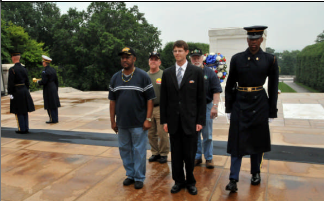
PTSD Unit honor guard of Vietnam and Iraq War veterans prepare to dismount after laying their wreath at the Tomb of the Unknown Soldier.